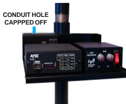
ALL HIDDEN METHOD POLE MOUNT PLATFORM WITH AMX® NI700 & NIGEL B AMPLIFIER