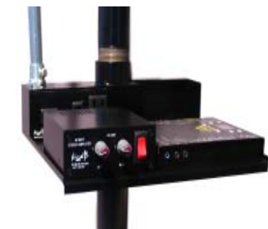
POLE MOUNT PLATFORM WITH AURORA MULTIMEDIA WACI® & NIGEL B AMPLIFIER