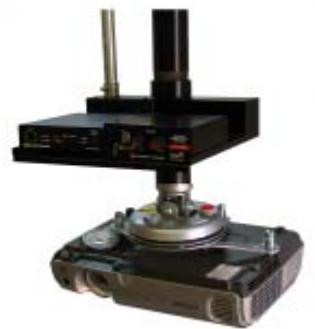
POLE MOUNT PLATFORM SHOWN WITH PREMIER MOUNT® & EPSON® PROJECTOR