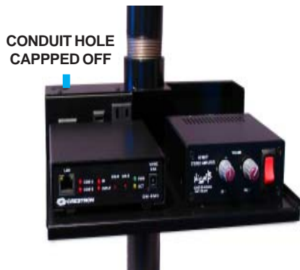
CONDUIT HOLE CAPPED OFF ALL HIDDEN METHOD POLE MOUNT PLATFORM WITH NIGEL B® PLUS AMPLIFIER & CRESTRON® QM-RMC/QM-RMCRX-BA

All Cables are normally run INSIDE the Projector Pole without modification to the Pole itself . Not only is it now easier to hide all the Cables from view, it also makes the entire Installation tidier as it eliminates the need to tie wrap everything outside the Pole.