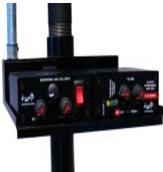
POLE MOUNT PLATFORM WITH NIGEL B LINE/MIC MIXER & NIGEL B PLUS AMPLIFIER