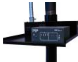
POLE MOUNT PLATFORM WITH EXTRON VERSA TOOLS®