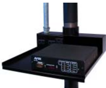
POLE MOUNT PLATFORM WITH AMX N700