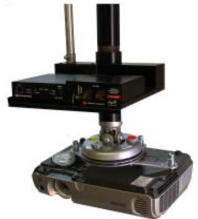
POLE MOUNT PLATFORM SHOWN WITH PREMIER MOUNT® & EPSON® PROJECTOR