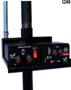
POLE MOUNT PLATFORM WITH NIGEL B LINE/MIC MIXER & PLUS AMPLIFIER