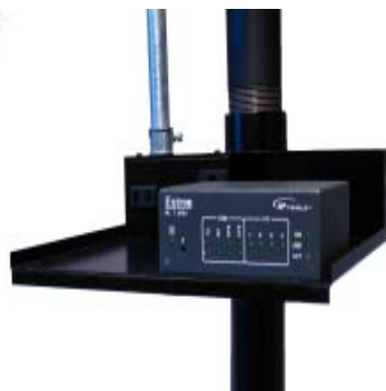
POLE MOUNT PLATFORM WITH EXTRON VERSA TOOLS®