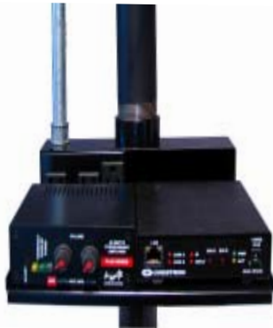
POLE MOUNT PLATFORM WITH NIGEL B® PLUS AMPLIFIER & CRESTON QM-RMC®

All Cables run INSIDE the Projector Pipe without modification to the Pipe. Not only is it now easier to hide all the Cables from View, it also makes the entire Installation tidier as it eliminates the need to tie wrap everything outside the Pole.