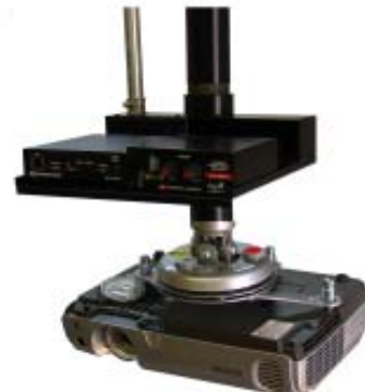
POLE MOUNT PLATORM PREMIER MOUNT® & EPSON® PROJECTOR