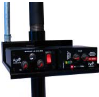
SHOWN WITH MIC / LIINE MIXER & PLUS AMPLIFIER

Refer to Leaflet "Pole Mount Platform" for full details