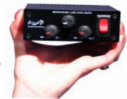
NB-MLM MIC / LINE MIXER

New for 2008 is our new Pole Mount Platform NB-PMP which allows everything typically used in an "Above Projector Installation" to be installed on the Platform with all wiring concealed.