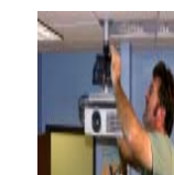
Pole Mount Platform Installation