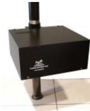
Pole Mount Plenum Box

All our Plenum Mounting Options meet NEC, State and UL Requirements