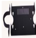
Multi Purpose Bracket also allows an Amplifier to be Mounted Vertically behind the back of a TV or Monitor

Universal 100 V -240 V Auto Sensing 24 V DC 6.3 Amps Output Power Supply UL / CSA Listed