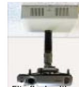
Fits flush with the Ceiling Tiles