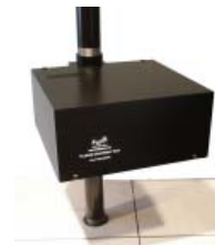
Pole Mount Plenum Box

All our Plenum Mounting Options meet NEC, State and UL Requirements