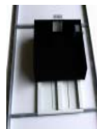
Ceiling Tile Kit with Plenum Box