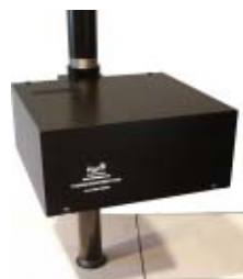
Pole Mount Plenum Box

Multi Purpose Bracket also allows our Amplifiers to be installed behind the back of a TV or Monitor