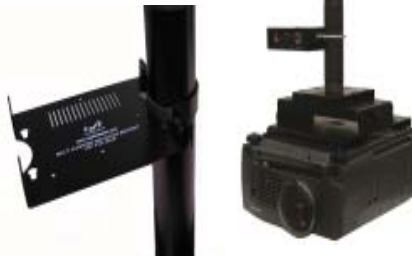
Multi Purpose Brackets Mounted on a Projector's Pole