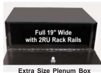
Full 19" Wide with 2RU Rack Rails Extra Size Plenum Box with Rack Rails