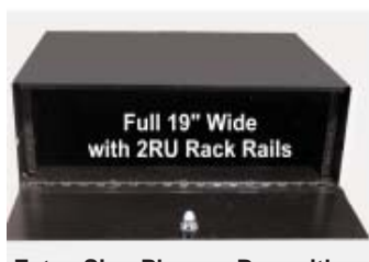
Extra Size Plenum Box with Rack Rails