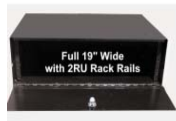
Extra Size Plenum Box with Rack Rails