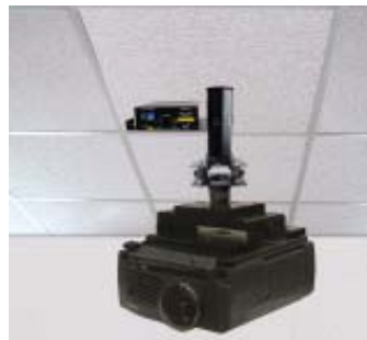
Multi Purpose Bracket Mounted on a Projector's Pole