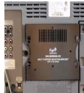
Multi Purpose Bracket also allow our Amplifiers to be Mounted Vertically behind the back of a TV or Monitor