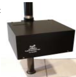
Pole Mount Plenum Box