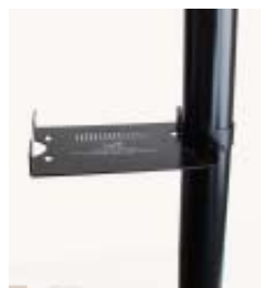
Multi Purpose Brackets Mounted on a Projector's Pole