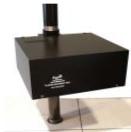
Pole Mount Plenum Box