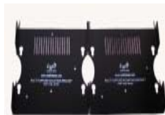
2 NB-MPB Brackets joined together when used on any Flat Surface