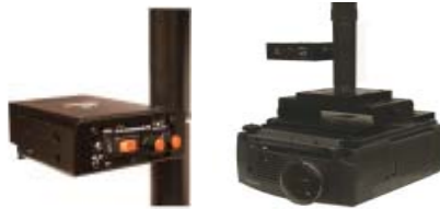
NB-MPB-P Single Pole Mount Bracket attached to a Projector's 1 1/2" Pole