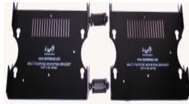
2 NB-MPB-P Brackets joined together when used on a 1 1/2 "Pole (Shown with NB-JK Joining Kit)