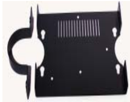
NB - MPB-P The Multi Purpose Bracket Pole Mount Version

It's simple to install any of our Amplifiers on any Projector Pole or Flat Surface. It's also just as simple when using either VESA Plates and the Multipurpose Bracket to attach any of our Amplifiers on to the Back of a TV Display Monitor. In the case of a TV Monitor the entire assembly adds less than 2" to the depth.