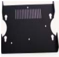
NB-MPB Multi Purpose Bracket for Mounting our Amplifiers on any Flat Surface or Structured Wiring Panels