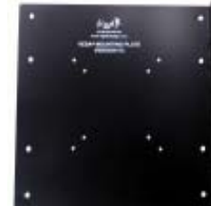
VESA Mounting Plate Pre-drilled for 150mm and 200 mm Mounting Holes Part # NB-V2