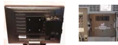
The Multi Purpose Bracket used with a VESA Plate attached to the back of a TV or Monitor for vertically mounting any of our Amplifiers