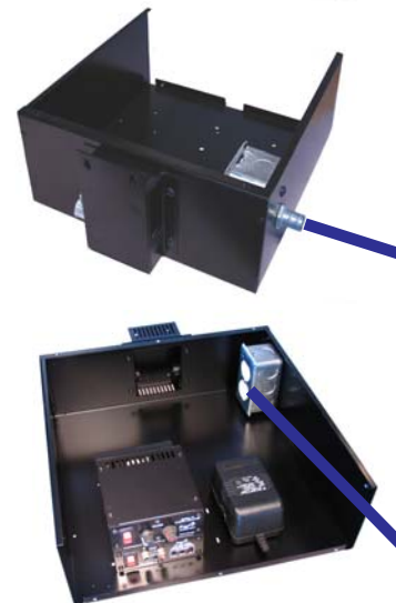
Inside View showing a Nigel B Amplifier & Power Supply fitted