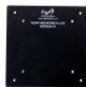
VESA #1 Mounting Plate Predrilled for 75 or 100 mm Mounting Holes Part # NB-V1 Dimensions: 5" x 5"