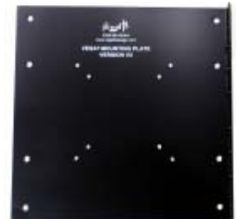
VESA #2 Mounting Plate Predrilled for 150mm and 200 mm Mounting Holes Part # NB-V2 Dimensions: 9" x 9"