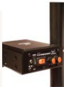
NB-MPB-P Single Pole Mount Bracket attached to a Projector's 1 1/2" Pole