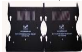
2 NB-MPB Brackets joined together for use on any Flat Surface