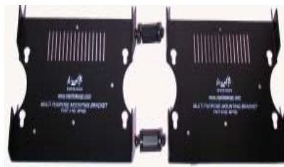
2 NB-MPB-P Brackets joined together for use on a 1 1/2 "Pole (Shown with NB-JK Joining Kit)