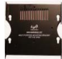
NB-MPB-V Multi Purpose Bracket for use with either VESA Mounting Brackets shown below