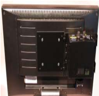
The Multi Purpose Bracket NB-MPB-V used with a VESA Plate attached to the back of a TV or Monitor for vertically mounting any of our Amplifiers