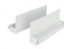
NB-CTSELB Ceiling Tile Supports