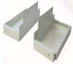
NB-CTSSPB Ceiling Tile Supports