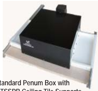
Standard Plenum Box with NB-CTSSPB Ceiling Tile Supports